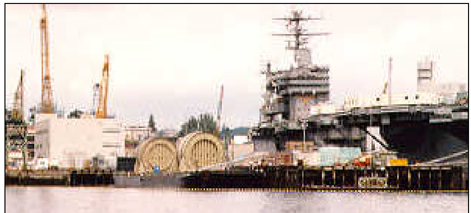
Two ready for departure from Puget Sound Naval Shipyard