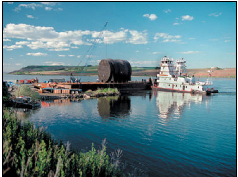
Moving down the Columbia